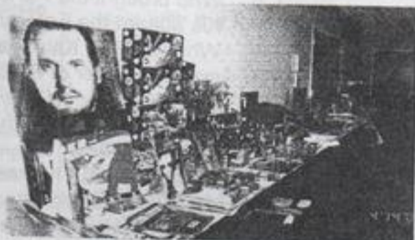
As you can see there was a lot of cool stuff that was auctioned off at our Charity Auction.

The second annual Charity Auction held by the USS Maximillian and their partner the IKB Scorpion was held on Sat April 14, 2001. Even though we had a very light turnout we managed to meet and beat last years total of $252. When all totals were calculated and we ended up bringing in (drum roll please) .....$532. WooHoo. The Scorpion took in a little over $100 and the Robert S. Lyon Memorial Scholarship took in a little over $100 and the rest will go into the ship's