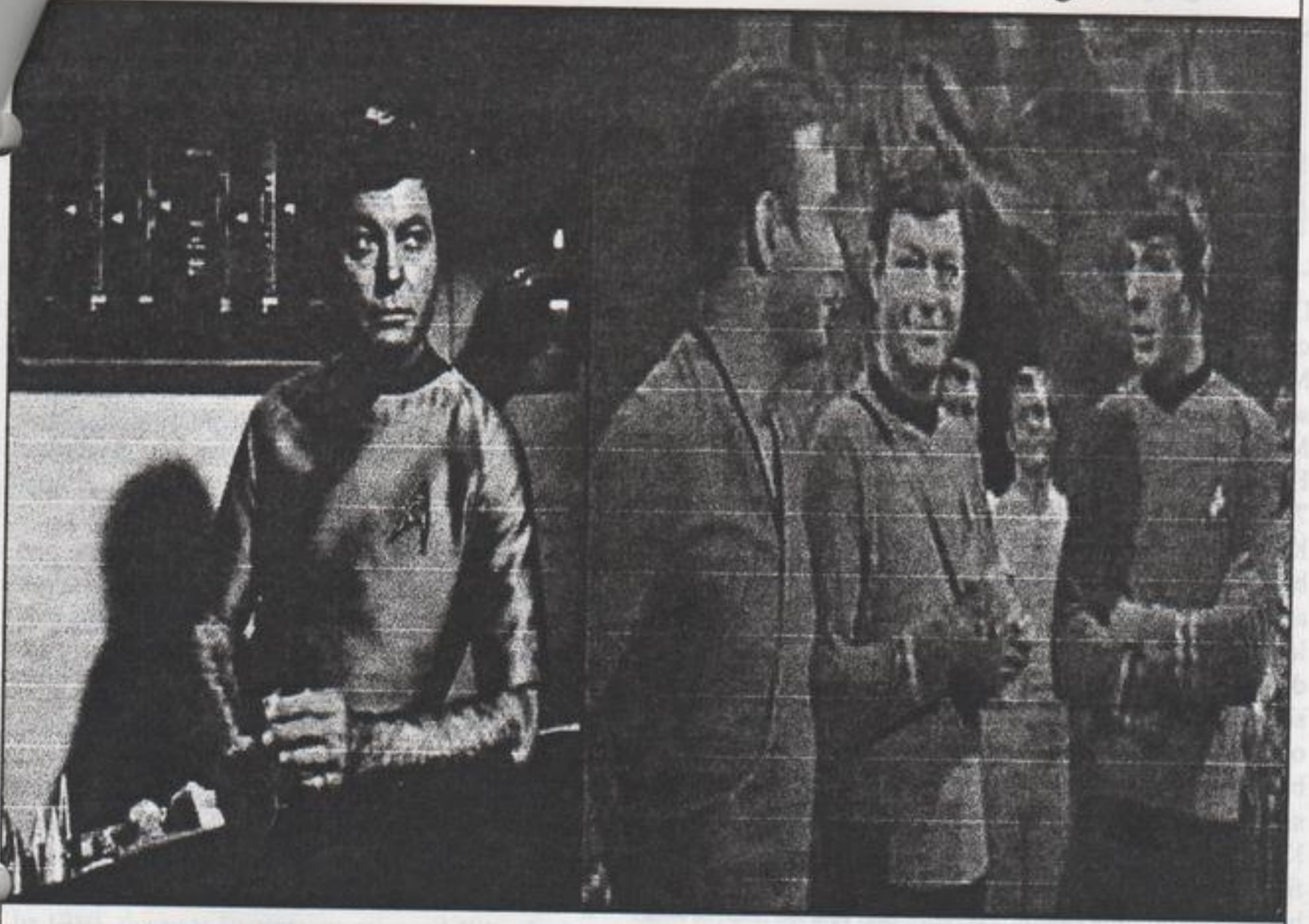
DeForest Kelley 1920-1999